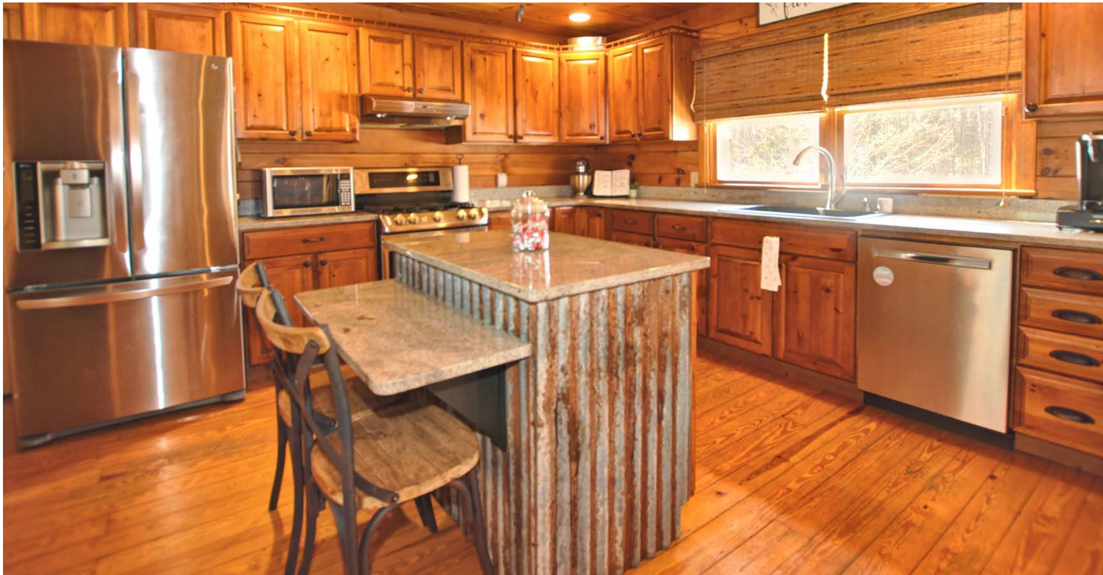
Kitchen Dimensions: 14'10" x 12'

The kitchen with a center island and breakfast bar has pinewood cabinets, a gas range, granite counters, and a ceramic sink, is open to the family room and can be accessed through the mudroom from the garage.