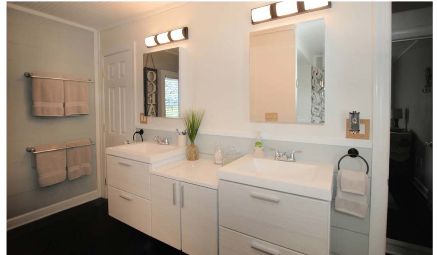
Second Floor Owner's Suite