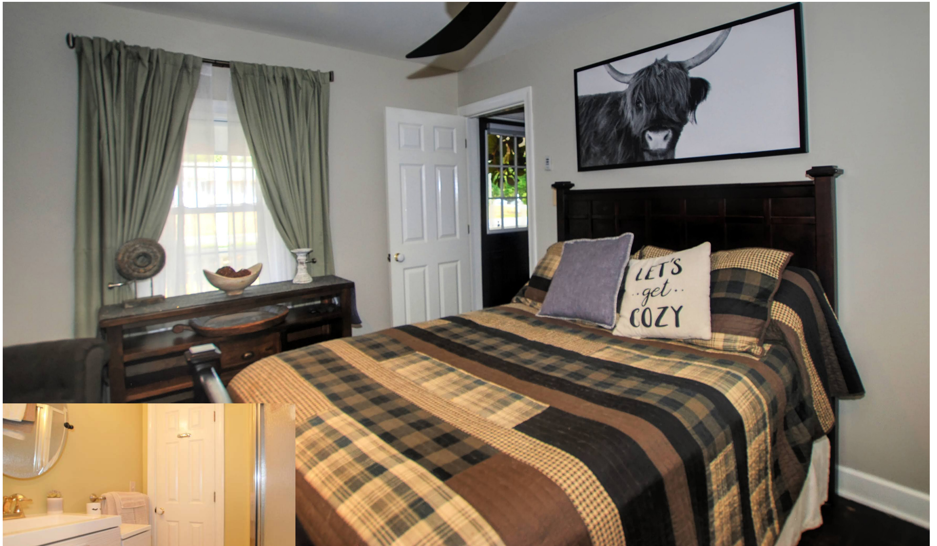
First Floor Bedroom and Bathroom